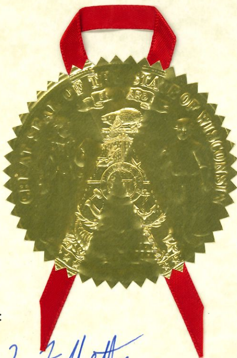
TONY EVERS GOVERNOR

IN TESTIMONY WHEREOF, I have hereunto set my hand and caused the Great Seal of the State of Wisconsin to be affixed. Done at the Capitol in the City of Madison this 6 th day of January 2023.